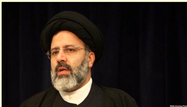
FILE - Ebrahim Raees Sadat, commonly known as Ebrahim Raeesi, is an Iranian cleric heading Iran's Judiciary.