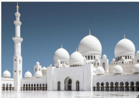
Sheikh Zayed Mosque seen from the courtyard with its floral design.

"We live in a time of rising antisemitism and terrorist attacks, which makes our responsibility as faith leaders greater, and even greater as Imams," the NGO said.